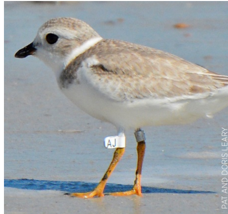
PAT AND DORIS LEARY

Saltmarsh habitats fared very well, performing the storm surge attenuation functions for which they are renowned. Cordgrass marshes were largely unimpacted, and effects to mangrove marshes were limited. Even in Florida Bay, where staff expected catastrophic torsion of mangroves comparable to that seen after Hurricane Wilma, trees showed only modest windburning, which will recover within a season.