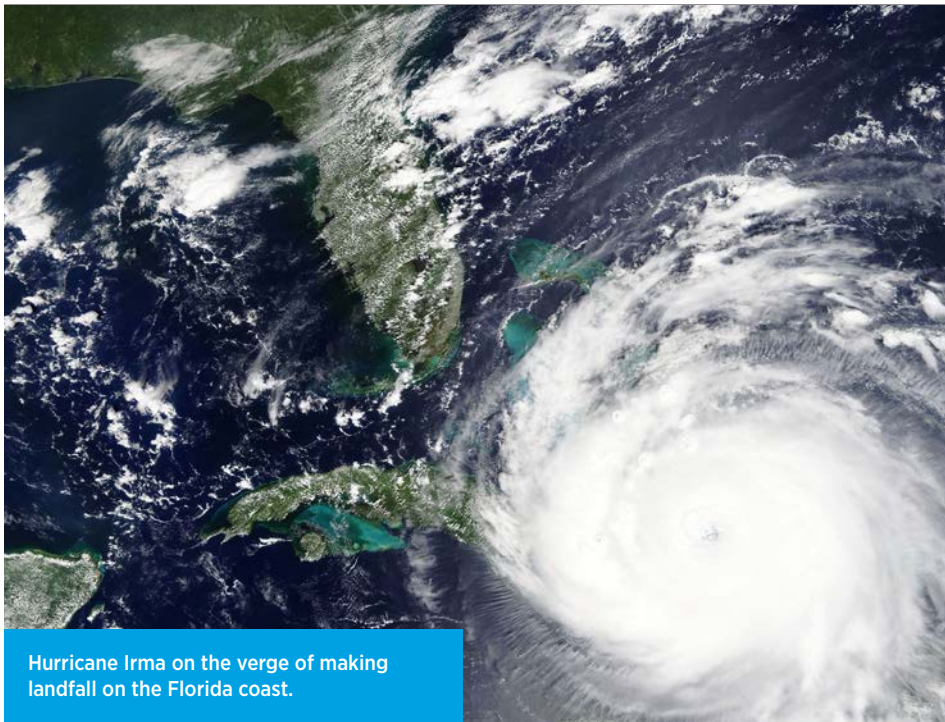
Hurricane Irma on the verge of making landfall on the Florida coast.