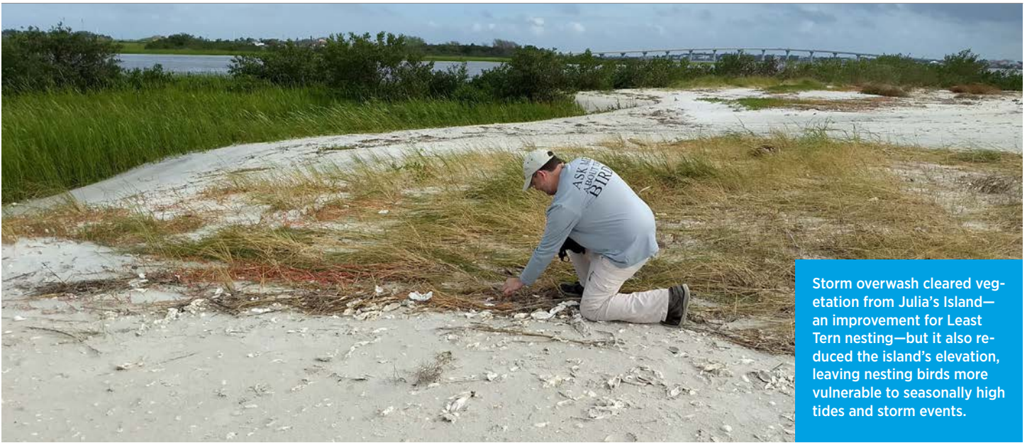
Storm overwash cleared vegetation from Julia's Island—an improvement for Least Tern nesting—but it also reduced the island's elevation, leaving nesting birds more vulnerable to seasonally high tides and storm events.