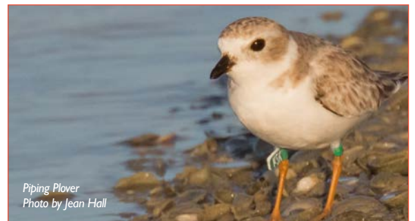
Piping Plover

Our work isn't over once nesting season winds down. In late summer, migratory shorebirds like Red Knots, Piping Plovers, and sandpipers begin passing through Florida. Audubon works with partners and volunteers to conduct a census of shorebirds and seabirds through fall and winter until the next nesting season begins. Resightings of banded birds help us unlock the secrets of these globetrotters. Beginning in late summer 2017, Audubon will expand migratory shorebird surveys from the Panhandle to the Tampa Bay Region and Southwest Florida.