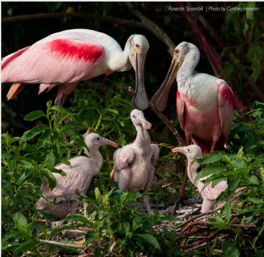
Roseate Spoonbill

This unanimous move by FWC was the culmination of more than a year of efforts by Audubon staff, chapters and partners who participated in public hearings. From Lanark Reef and Flag Island in the Panhandle, to Nassau Sound in Northeast Florida to Rookery Bay in Naples and Stick Marsh near Vero Beach, the future is brighter for Florida's nesting coastal birds to coexist with recreating Floridians and visitors.