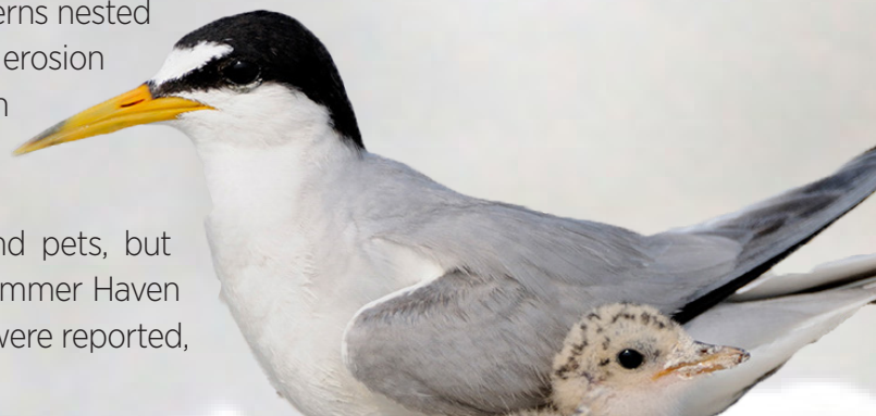
Least Tern

The region's star was Huguenot Memorial Park once again, where seasonal beach driving closures made all the difference. Thousands of Royal Terns nested among the dunes, fledging more than 2,300 chicks. Major erosion from Hurricane Matthew in October reshaped the park's beach habitat and access. In other areas, Least Tern ground colonies fledged small numbers of young. Stewarding by Audubon volunteers has greatly reduced disturbance from visitors and pets, but predators contributed to poor performance. Good news at Summer Haven in St. Johns County: more than a dozen Wilson's Plover nests were reported, and plover families were a frequent sight.