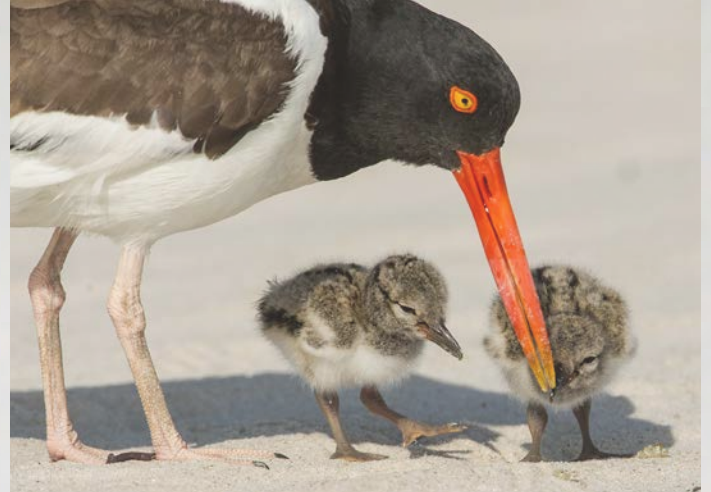
American Oystercatcher

The Panhandle's sprawling sugar sand beaches and remote islands are ideal habitat. Despite tragic losses to Tropical Storm Colin, the Panhandle still managed to fledge chicks in 2016. Seabird colonies and solitary nesting shorebirds occupied 29 ground nesting sites from Pensacola Beach to Alligator Point. Audubon biologists found more than 1,200 Least Tern nests but only 170 fledged chicks. Black Skimmers did better with 503 nests fledging 303 chicks. Snowy Plovers fledged more young overall than in 2015 especially in state parks, with 20 chicks fledged on remote St. Joseph Peninsula State Park alone.