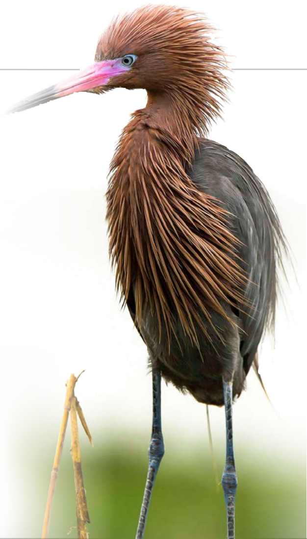
Reddish Egret

To get to the bottom of this mystery, Audubon was enlisted by the Florida Fish and Wildlife Conservation Commission to help survey the state's Reddish Egrets in 2016. The survey confirmed that roughly 30 percent of the state's population nests in Tampa Bay, and the majority of those 85-92 pairs use islands protected by Audubon. Audubon's Everglades Science Center surveys also found 54-88 Reddish Egret pairs in upper Florida Bay. Final statewide results are still being tabulated. This essential data will help drive conservation policy for Reddish Egrets and their allies.