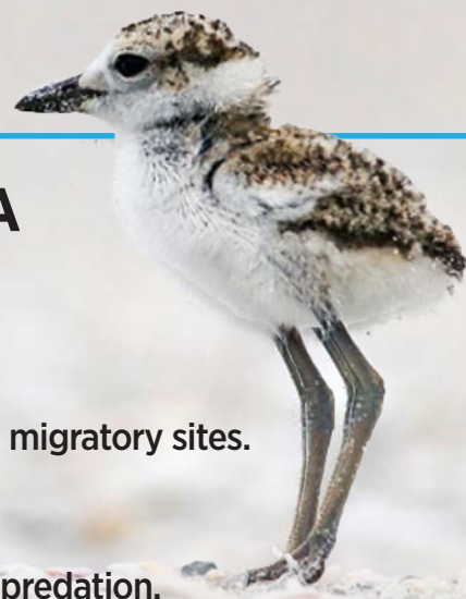
Wilson's Plover chick

Enlist volunteer stewards, citizen scientists, and advocates led by staff scientists and policy experts.