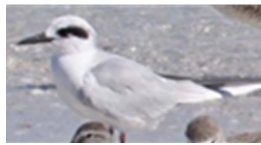
Forster's Tern (FOTE): small, black rectangular patch around eye in winter