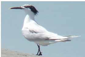
Sandwich Tern (SATE)*: mid-size, black bill with yellow tip, shaggy crest in back of neck