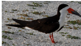
Black Skimmer (BLSK)*: black and white, short legs, lower half of bill longer than upper

Look to field guide to ID less common species including Common Tern (resembles Forster's Tern), Black Tern (mostly seen during fall migration, distinctive behavior and plumage) and Gull-billed Tern (stout black bill).