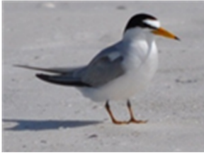
Least Tern (LETE)*: smallest, yellow bill and legs, white forehead, not in Florida in winter

Terns: “sporty” appearance, most species dive to catch their food