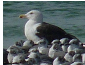
Great Black-backed Gull (GBBG): the largest, back quasi black, pinkish legs