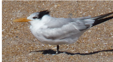
Royal Tern (ROYT)*: large, common. orange bill, usually in flocks