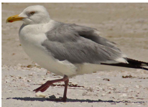
Herring Gull (HEGU): large, light grey, pinkish legs