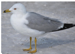
Ring-billed Gull (RBGU). medium, numerous in winter, light grey; adult's bill yellow with vertical black bar