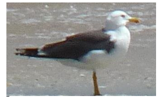
Lesser Black-backed Gull (LBBG): slightly smaller than Herring Gull, yellow legs in adults