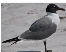
Laughing Gull (LAGU)*: small, common year round, black head during breeding

Gulls: take 2-4 years to mature. Brownish gulls are juveniles of the various species – refer to field bird guide