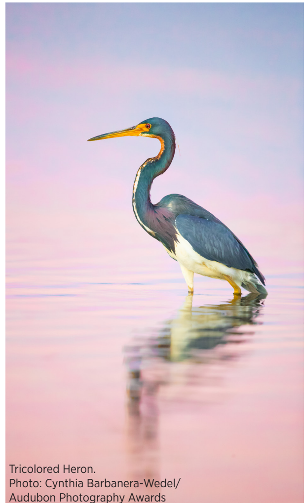
Tricolored Heron.