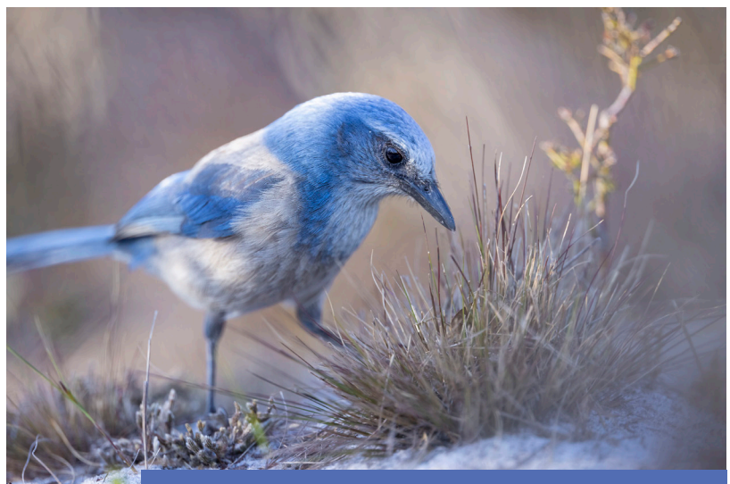
Florida Scrub-Jay.

Members of the West Volusia Audubon Society's Friends of Lyonia Environmental Center will be on hand to answer questions and lead tours of the Center and gardens with a short hike into the preserve.