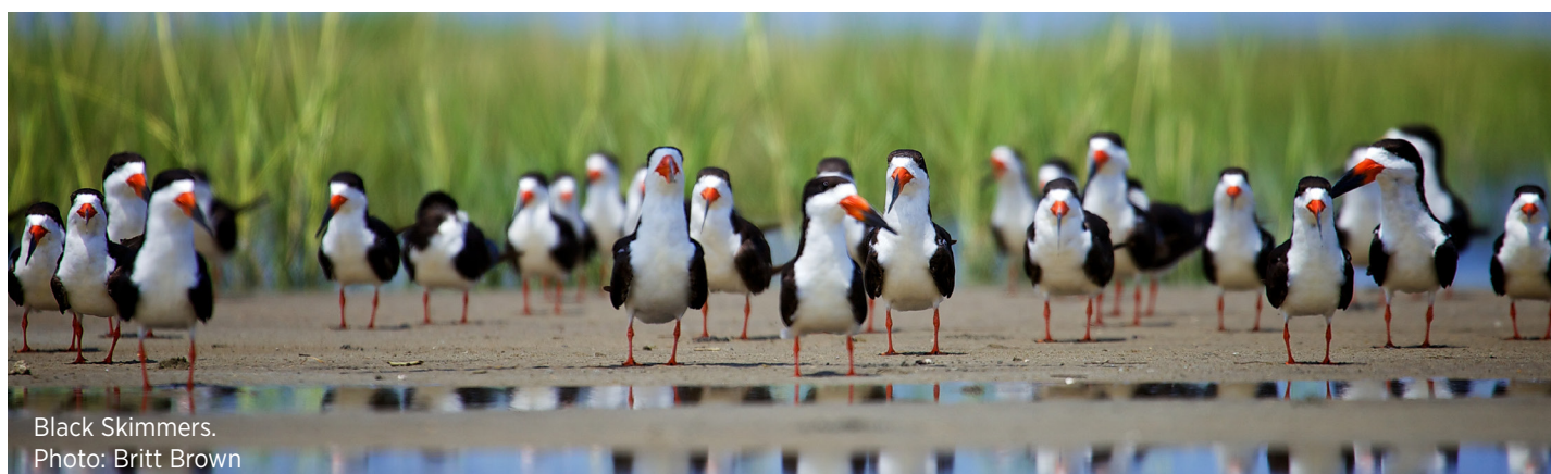
Black Skimmers.