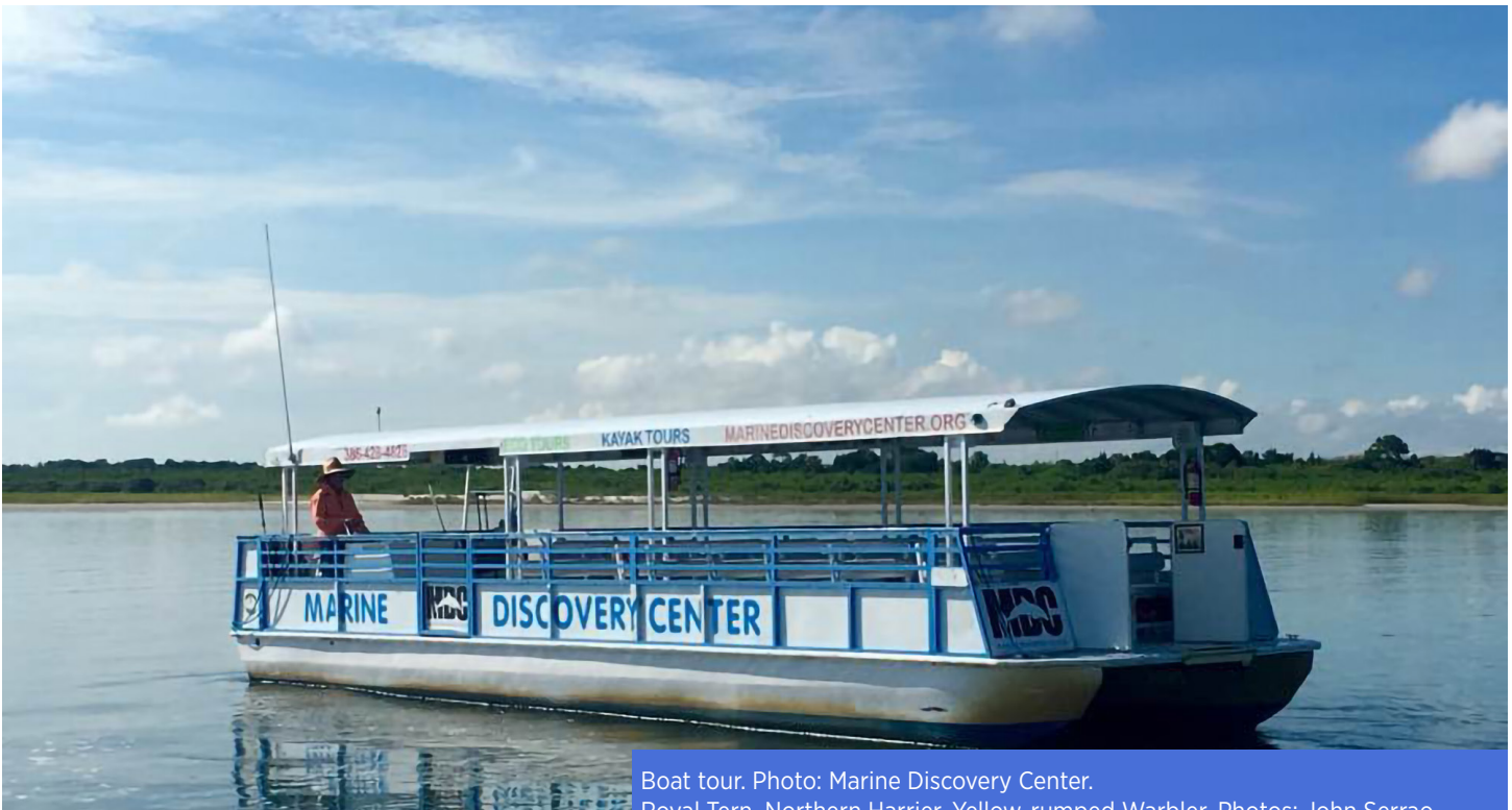
Boat tour. Royal Tern, Northern Harrier, Yellow-rumped Warbler.