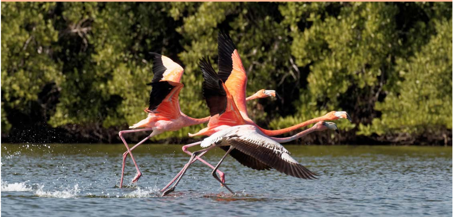
American Flamingo | Photo: James Fillmore

Visit FL.Audubon.org/Assembly for Updates and Registration Details