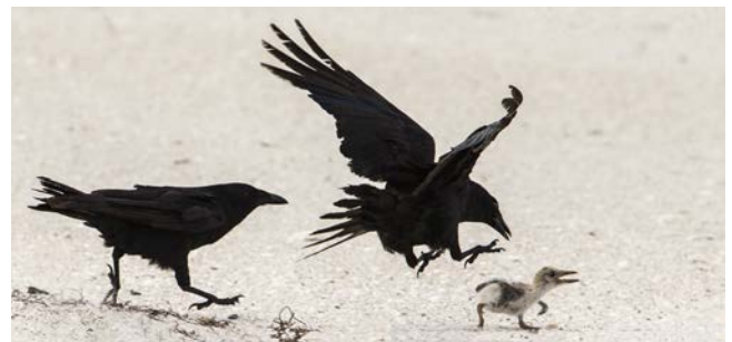
When parents are flushed from nests by human disturbance, chicks and eggs are vulnerable to predators like Fish Crows.

Audubon and our partners in the Atlantic Flyway Shorebird Initiative recently embarked on an innovative, flyway-level project to better understand the impacts of human disturbance to shorebirds. Researchers along the Atlantic Coast and Florida’s Gulf Coast are gathering disturbance data in both nesting and non-nesting shorebirds. This modern form of conservation science considers not only the human role in disturbance but will also help determine strategies to encourage more shorebird-friendly behaviors by people. Acclaimed shorebird researchers at Virginia Tech are collecting and analyzing this data, and we hope to share valuable insights from this project soon.