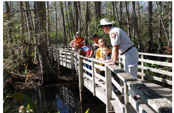
Thousands of visitors stroll back in time through the historic cypress swamp each year at Audubon's Corkscrew Swamp Sanctuary.

That shared awe is at the heart of Audubon's celebration this year, declaring 2018 the Year of the Bird. On this 100 th anniversary of the Migratory Bird Treaty Act—the landmark legislation which ended the plume trade and gave rise to Audubon—we are celebrating the use of sound science to inform strong policy to protect the birds and places that inspire us.