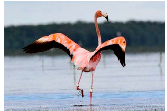
Originally banded in the Yucatan Peninsula, this American Flamingo was seen in Snake Bight, Florida.