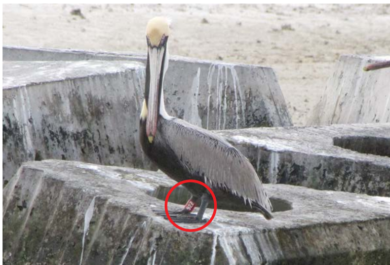
Banded Brown Pelican spotted at an Audubon sanctuary eight years after being rescued from the 2010 Deepwater Horizon Disaster.

The Alafia Bank hosts the largest Brown Pelican colony in the Tampa Bay region and is an important bird nesting island for the entire Gulf. Right now, the Sanctuary is under threat of dangerous invasive trees that are crowding out the native plants that birds need. Audubon Florida secured a matching grant to fund the replacement of the invasive invaders with beneficial native plants. Every dollar Audubon raises is matched $1-for-$1, and more than 200 generous donors have supported restoration work so far. If you'd like to support this good restoration work, visit FL.Audubon.org/SaveAlafia . Be sure to stay tuned to our social media for updates!