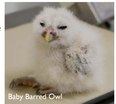
Baby Barred Owl

You can help too. Many of Florida’s raptors are cavity and tree nesters, and disturbing nests by trimming trees in the spring puts them in danger. Until the fall, hold off on trimming trees in your yard. There’s never been a better reason to procrastinate!