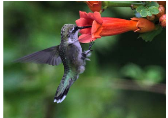
Native to Florida, Campsis radicans (trumpet creepers) are a favorite for Ruby-throated Hummingbirds and butterflies.

In March, Bay County Audubon hosted Birds, Bugs and Berries, a well-attended symposium on native plants. Expert birders, native plant enthusiasts, and gardening specialists highlighted the importance of native plants for both birds and the bugs they need. Insects provide an important source of protein for birds, especially young song birds. Bird populations have dramatically declined due to habitat loss and climate change, and native landscapes empower homeowners and business to help both the environment and the birds.