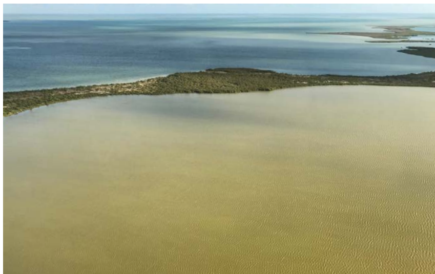
Madeira Bay in Florida Bay plagued with algal blooms late last year.

As an estuary, Florida Bay is incredibly sensitive to the quantity of freshwater it receives. In the right conditions, seagrass, fish, and other wildlife thrive in Florida Bay. But without sufficient freshwater, salinity rises and endangers the seagrass, fish, and invertebrates that provide important ecological functions like oxygenating and filtering the water.