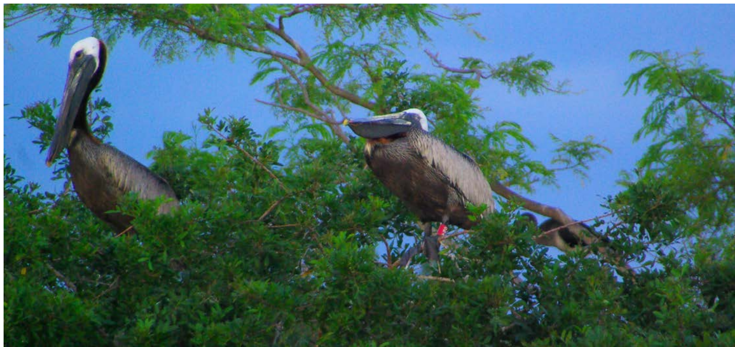
Banded Brown Pelican R0Z4 spotted at an Audubon Sanctuary three years after its initial rescue from the 2010 Deepwater Horizon Disaster.