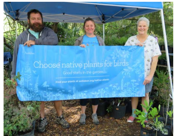
Four Rivers Audubon members encouraging their neighbors to plant native plants in at home.

This Northern Mockingbird stands on top of the bright pink flowers that adorn eastern redbuds. Redbuds' nectar attracts hummingbirds while its seeds are a hit with many species.