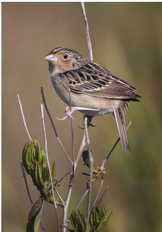
Florida Grasshopper Sparrow.

Bright sunshine begins to appear over a yellow-green Florida prairie. Last night's dew on the shrubs and grasses begins to dry in the hot sun. And the faint buzz of insects fills the air. Spring has finally sprung and male Florida Grasshopper Sparrows are up and singing on Florida's dry prairie ecosystem, as they have for millennia. But this year is different.