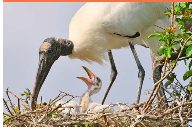
Corkscrew is a historic stronghold for Wood Storks. These slow-walking storks often feed in shallow pools of water, catching trapped fish. Too little or too much water in wetland habitats make it difficult for storks and wading birds to find food for themselves and chicks.