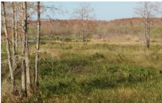
Removing willows helps restore vital wetlands at Audubon's Corkscrew Swamp Sanctuary.