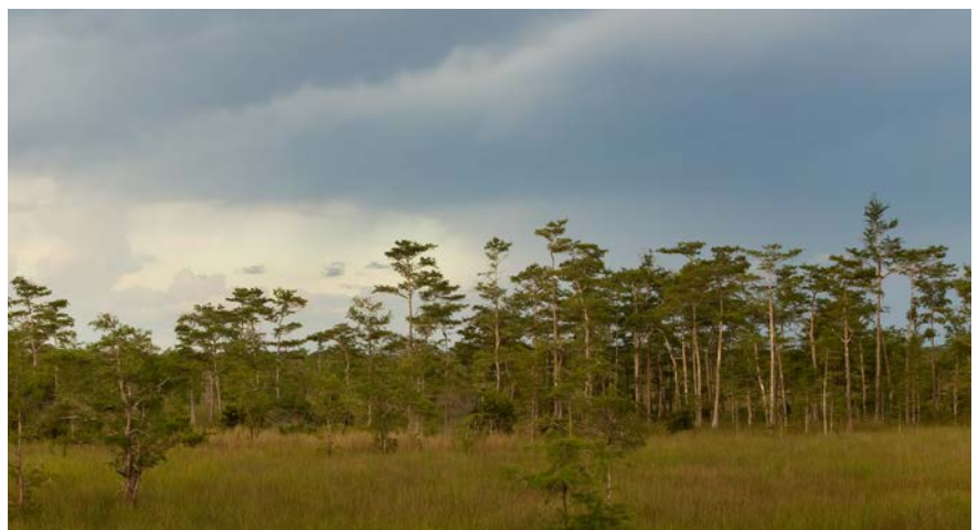
Florida prairie habitat is slowly disappearing, making it harder for species like the Florida Grasshopper Sparrow to survive.

To learn more about our work to protect and save the Florida Grasshopper Sparrow and other imperiled species, follow us on Facebook and Twitter and sign up for Audubon Florida emails at FL.Audubon.org/SignUp .