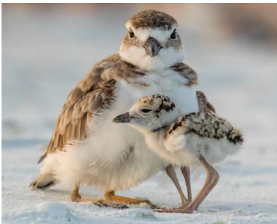
Wilson's Plovers depend on places like Little Estero Island Critical Wildlife Area to nest and raise young.