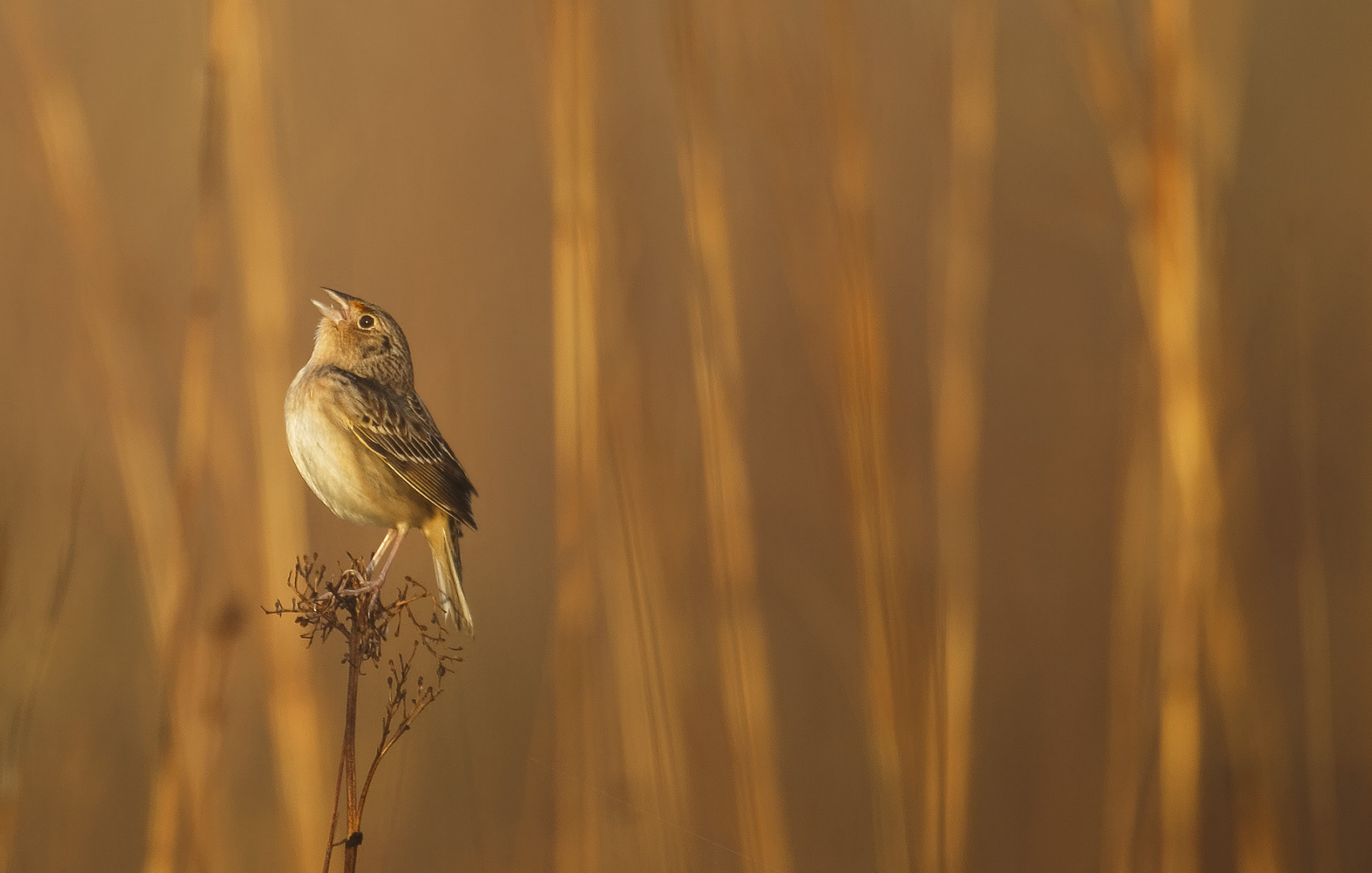
Florida Grasshopper Sparrow.

Researchers have also made strong moves to protect the species, including marking most of the remaining sparrows with colored leg bands to track their lives and putting predator fences around nests (raising nest success to much higher levels). Yet the decline continues and now there is evidence that adults have lower annual survival rates than they used to.