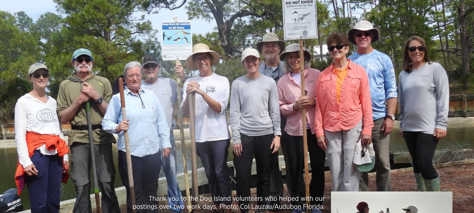
Thank you to the Dog Island volunteers who helped with our postings over two work days.