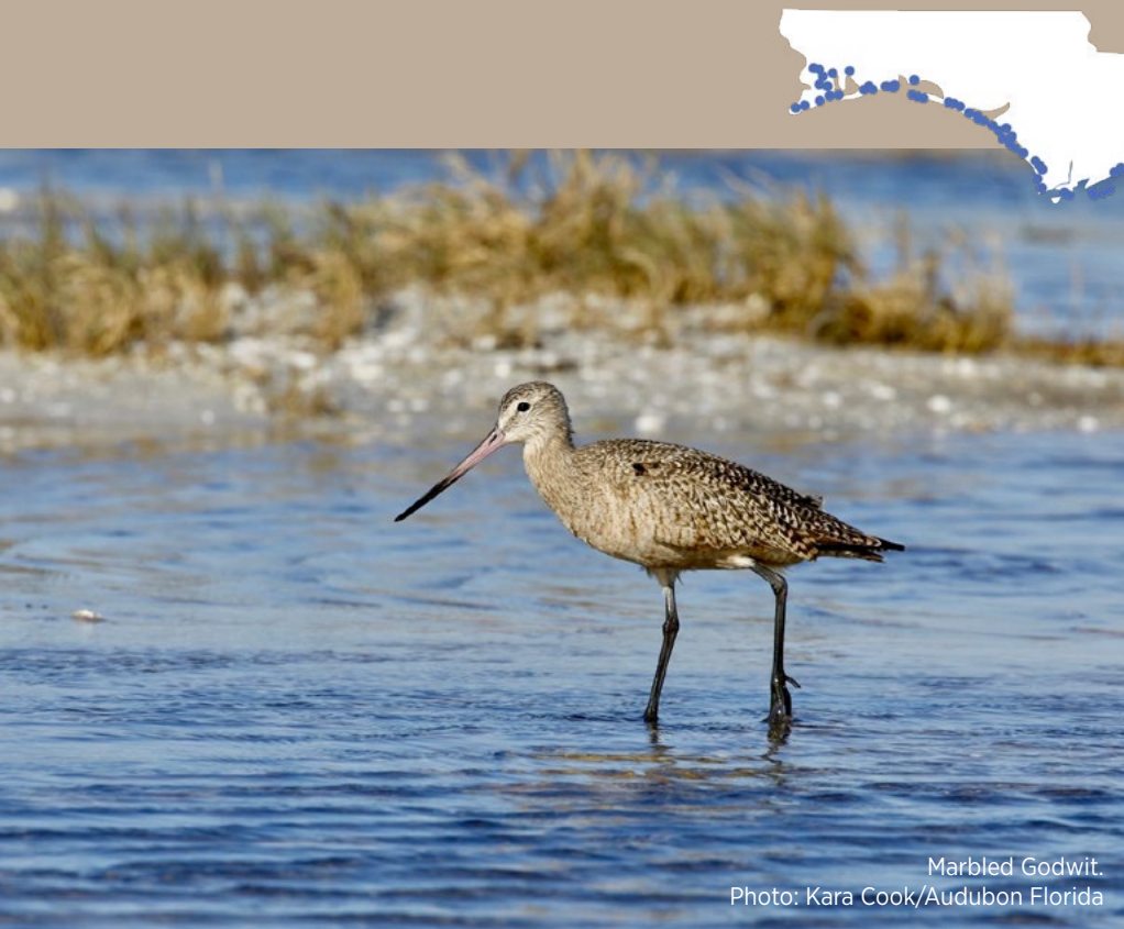
Marbled Godwit.