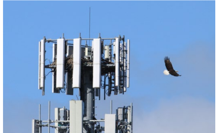
▲ An adult eagle takes off from nest PS040.

The eaglet successfully fledged a few weeks later.