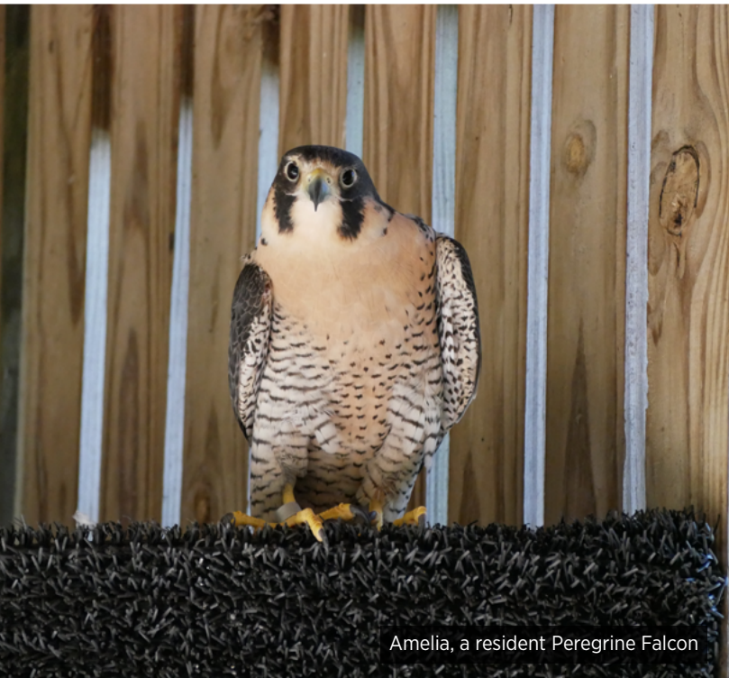
Amelia, a resident Peregrine Falcon