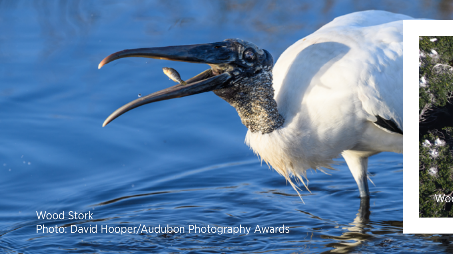
Wood Stork