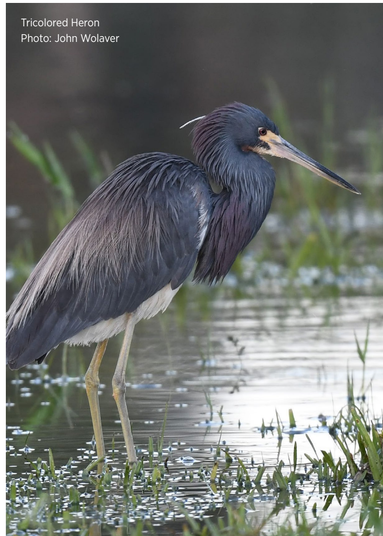
Tricolored Heron

While the framework does not fund some programs at high enough levels to fully meet the challenges of our changing climate, we hope that critical climate investments will follow passage of the framework. These could include a Clean Energy Standard, federal incentives for electric vehicles and renewable energy generation, and investments in climate resilience. Meaningful investments in resilience would include restoration and protection of wetlands, barrier islands, and other landscapes that buffer communities and wildlife from the impacts of climate change.