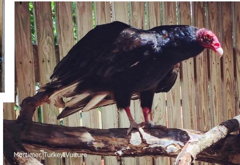
Mortimer, Turkey Vulture

Hundreds of injured or orphaned birds arrive at Audubon each year. Many are released back into the wild, however, some remain non-releasable and are housed at the Center or placed at other facilities throughout the country. These education ambassadors at the Center educate visitors about raptors, challenges they face, and how people can become involved in conservation.