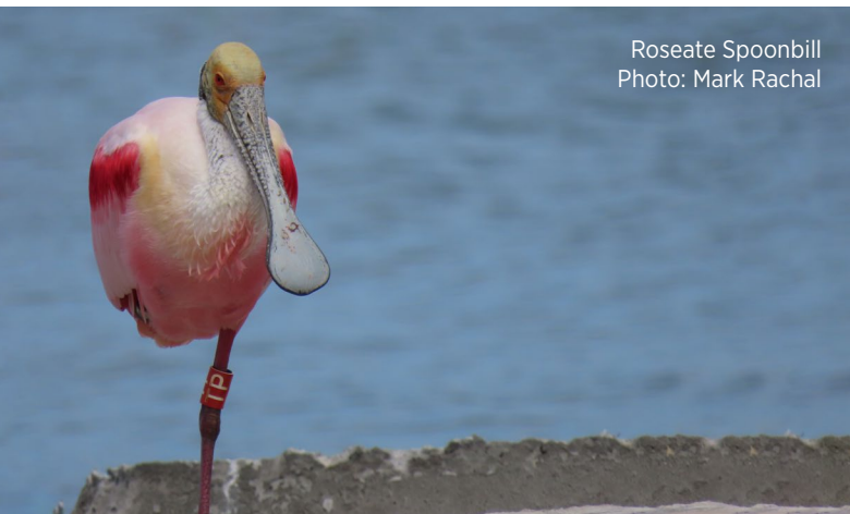
Roseate Spoonbill