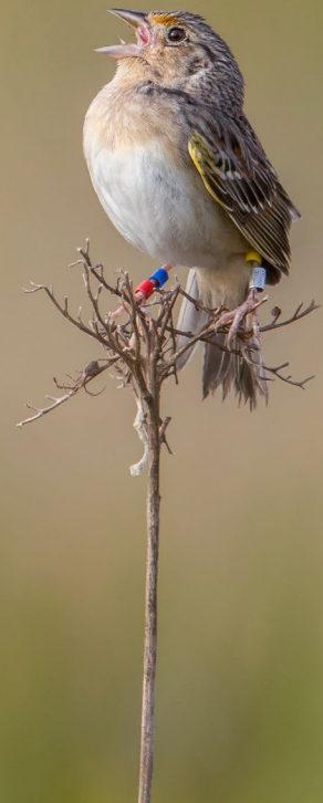
Florida Grasshopper Sparrow

The reason for the sparrows' decline remains unclear. Is it disease, low nest success, low annual survival, habitat management problems? Captive releases buy us time to resolve underlying issues driving declines.