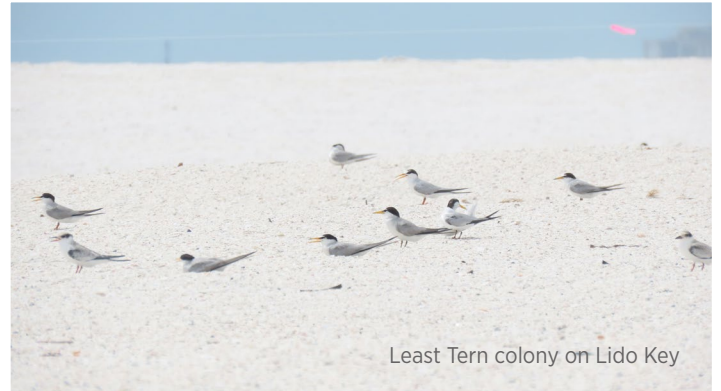
Least Tern colony on Lido Key