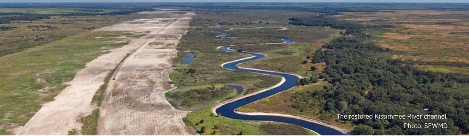
The restored Kissimmee River channel.