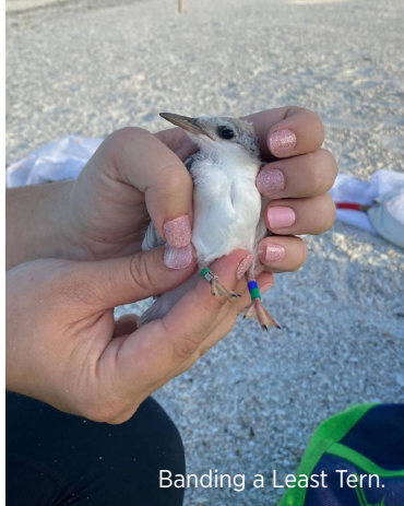
Banding a Least Tern.

» We have already learned so much. For example, Black Skimmers spotted at Clam Pass in Collier County in mid-winter include birds banded in FL, NJ, NY, NC, VA, and MA, which highlights the importance of Florida’s Gulf Coast beaches to skimmers from as far north as New England.