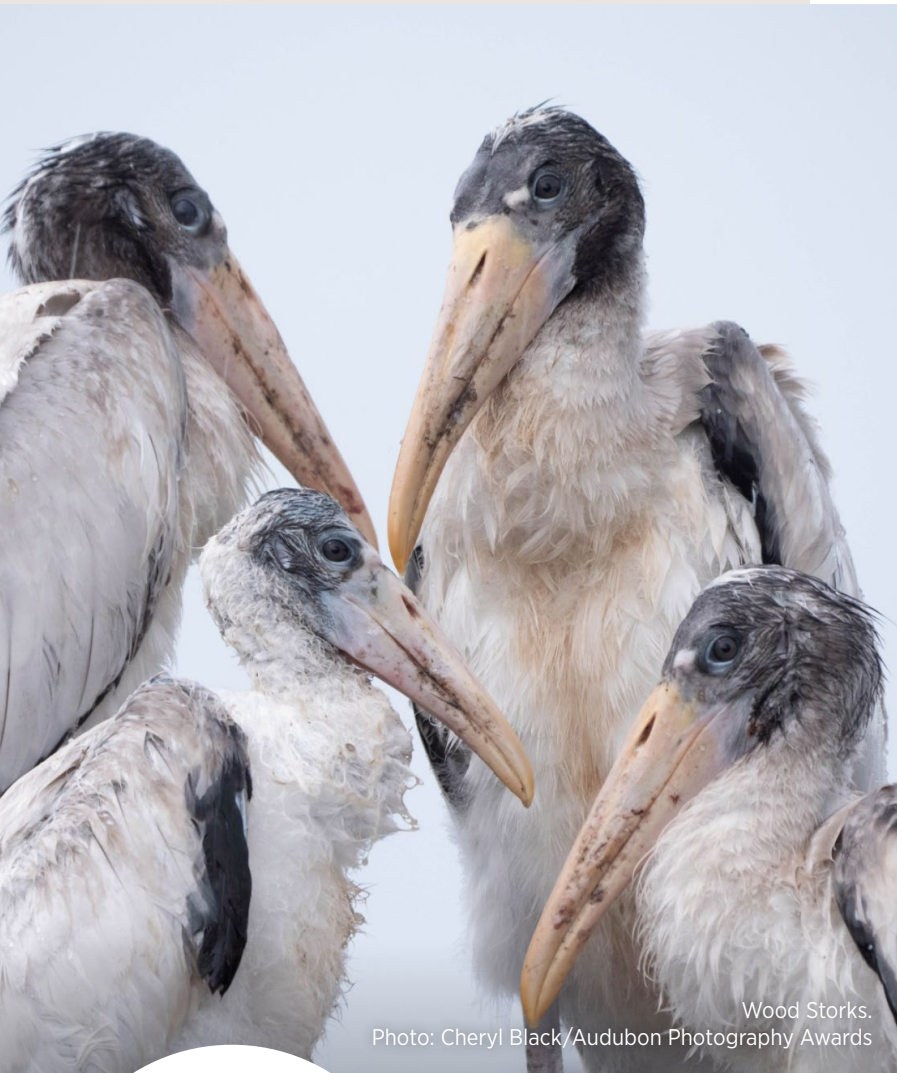
Wood Storks.