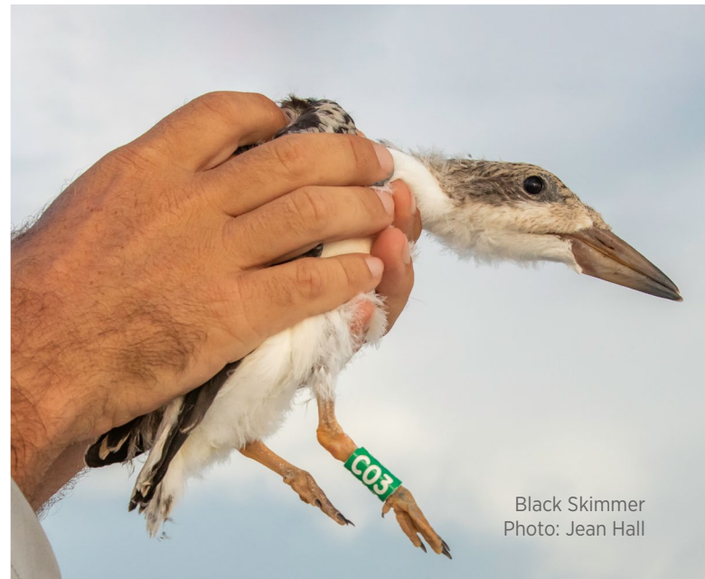
Black Skimmer