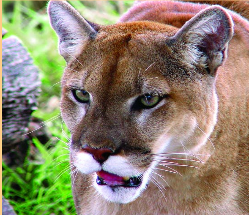
Photo of Florida panther

Audubon is bringing all these tools to bear to restore the Coastal Everglades and the wildlife and birds that depend on this habitat for survival. Visit www.audubonofflorida.org and www.tropicalaudubon.org to learn how you can help in these efforts to preserve and restore our natural heritage.