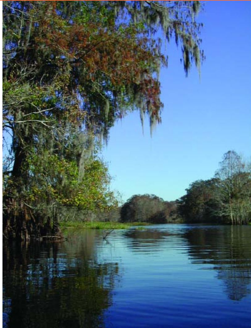
Photo of Green Swamp/Withlacoochee River

Signs indicate that growth pressures are ramping up. Unless conservation efforts increase, this wilderness that begins only six miles from Disney World could lose its identity in a sea of subdivisions. Recently the Florida Department of Community Affairs, which administers Area of Critical Concern regulations, challenged a proposal by the City of Groveland and a local development company. Unfortunately, the agency's lawyers were outmaneuvered by those of the