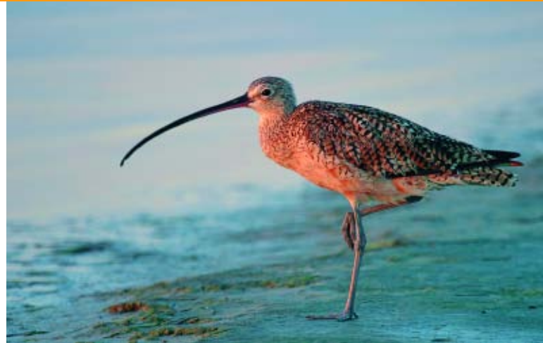
Photo of long-billed curlew

Details including Assembly registration information, programs, exhibits and field trips will appear in the summer Naturalist, and will be available online at www.audubonofflorida.org in July.