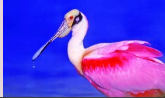
Photo of roseate spoonbill

Over the past few years, Seminole Audubon Society (SAS) has conducted wading-bird surveys around Jane Isle in Lake Jesup in Central Florida. These efforts have culminated in the inclusion of Jane Isle (also called Bird Island) in Project Colony Watch, Audubon of Florida's statewide wading-bird nesting inventory.