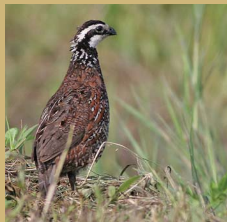
Topping the list of common birds in decline is this Northern Bobwhite species.

Without these natural lands and fresh water there will be no stopping the decline of these common birds or the quality of life for everyone, and everything, in Florida. You already are part of the solution, simply by supporting us. For that, I thank you. But please, if you can, take the next step and join us at the Assembly in November in Cocoa Beach. You'll be among friends and a part of something important. Because the future of Florida's common birds, and Florida itself, starts with a few uncommon actions by a lot of us common folks. I look forward to seeing you at this year's Assembly.