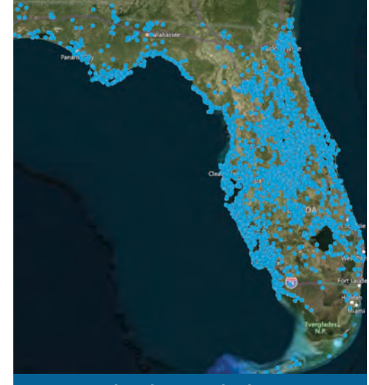
To view the map, check out: https://cbop.audubon.org/conservation/ about-eaglewatch-program

EagleWatch volunteers collect a treasure trove of data on the nests they monitor, including nest status (active, inactive, gone), fledgling success, and notable disturbances nearby. How could the Center for Birds of Prey team make all this available for users at a click of a button?