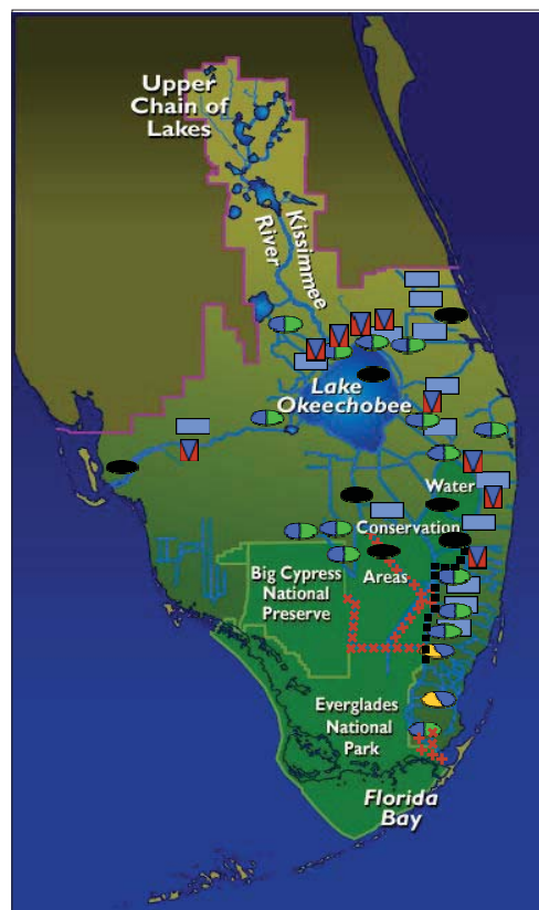
Figure 3. Major components of the Restoration Project.

Linking science to management decisions is critically important to achieve restoration goals, but the effectiveness of current mechanisms has come under question by some in the restoration community. The committee encourages Restoration Plan leadership to examine this issue and consider mechanisms to improve the communication of relevant scientific findings to decision makers.