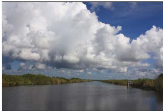
Figure 1. Canals and levees have radically altered the flow of water in the Everglades, and development has reduced the area of the ecosystem by half.

Concerns about declines in the environmental quality of the Everglades led to the initiation of the Comprehensive Everglades Restoration Plan (hereafter the Restoration Plan) in 2000. The goal of this multi-decadal effort is to reestablish the hydrologic characteristics of the Everglades with a water system that simultaneously meets the needs of both the natural and human systems of South Florida.