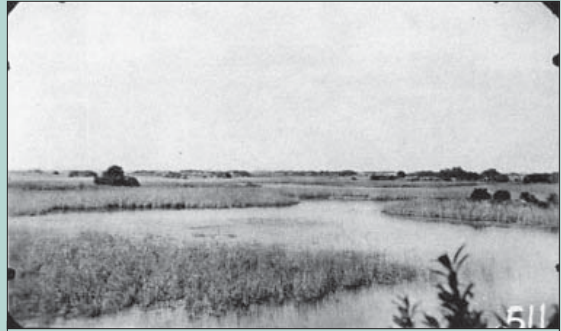
Figure 4. Ridge and slough landscape in its pre-drainage condition. Note sharp, distinct edges on most sawgrass ridges, and the open water of sloughs. Photograph taken by explorer John King in March 1917.

Only in the last few years have researchers begun to generate a clear understanding of how the distinctive Everglades landscape formed and is maintained. This research has fundamentally changed the conceptualization of the Everglades system from a set of separate plant communities to an interlinked peat-based system in which flow, the very low nutrient content of surface water, and the interaction of different plant communities shaped the characteristic forms of the landscape. As restoration planners now consider the potential benefits and costs of different designs for increasing water flows to the south, this is an illustration of the application of scientific understanding to inform restoration goals and management decisions.