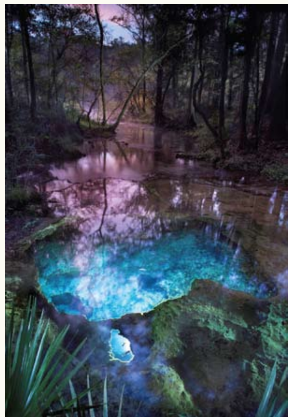
Mystic Springs, Chipola River.

Pursuant to the Articles of Incorporation and Bylaws, notice is hereby given that the Annual Meeting of the Florida Audubon Society will be held at the Lake Mary Marriott, Lake Mary, Florida at 1:45 p.m. on Saturday, October 15.