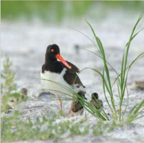
Audubon helped organize opposition to plans to put an RV camp at Honeymoon Island (shown above.) State officials withdrew the proposal affecting this and other popular parks.