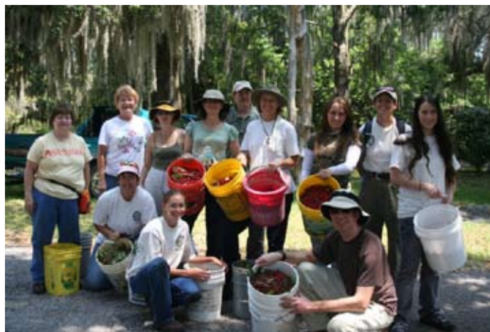
The Brooksville Ridge volunteers picked invasive coral ardesiaberreries at Ahhochee Hill.

Hernando Audubon Society and Brooksville Ridge Volunteers have supported Ahhochee Hill for many years through removal of invasive plants and other activities. On June 11, volunteers spent a morning picking buckets of invasive coral ardesia berries at Ahhochee Hill. Another berry picking day is planned for Oct 29 as part of the TogetherGreen grant. This invasive plant is the most challenging management issue at Ahhochee. To aid with hauling equipment, buckets of invasive berries and tools, Hernando County Audubon members recently raised enough money to purchase a John Deere Gator utility vehicle. This will be a tremendous help in managing this special place.