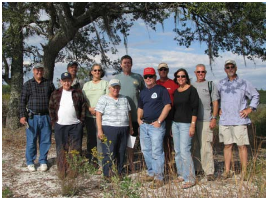
Eric Draper joins other Audubon members and conservationists in kicking off the Florida's Special Places Campaign. The site is Big Blue Lake in Washington County owned by the Knight family. Learn more about Florida's special places on pages 5-8.