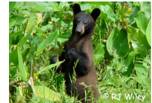
Florida Black Bear